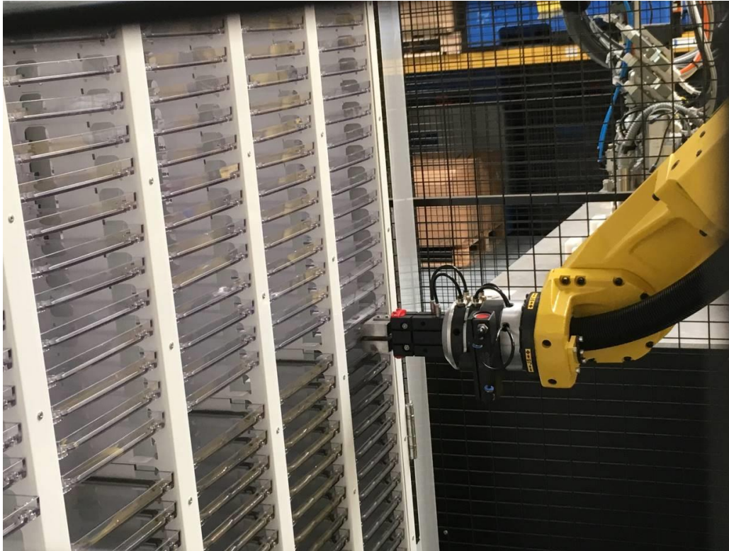
Picture 2: Component warehouse with automatic removal and loading by means of a handling robot